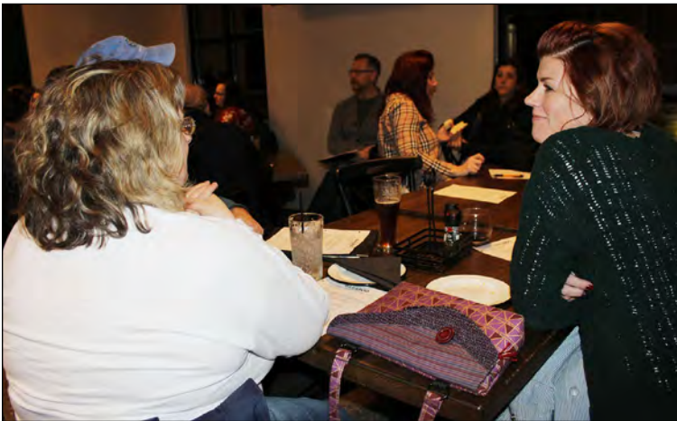
AMBASSADORS MEETING AT TUMBLER ROCK • JANUARY 27