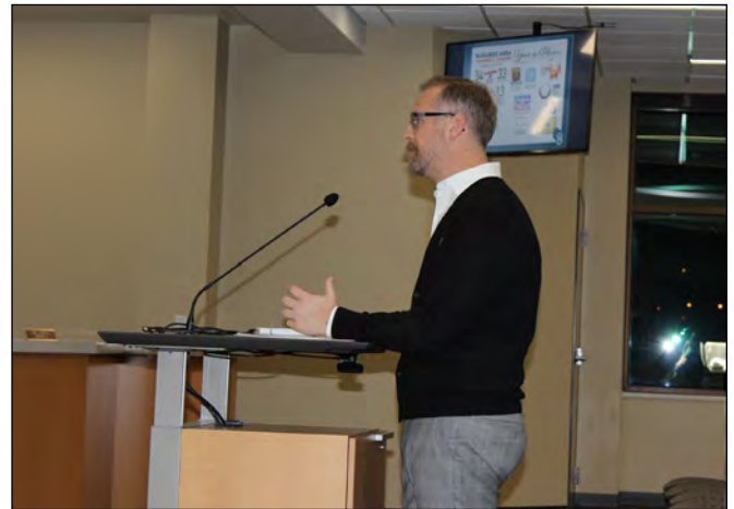
ADDRESS TO BARABOO COUNCIL • JANUARY 28