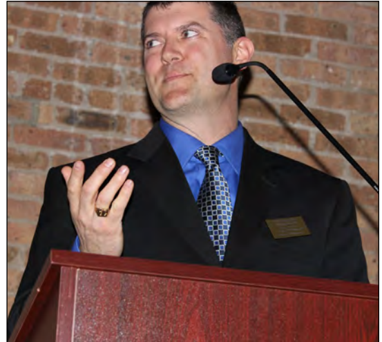
^ TOURISM AWARD: DEVIL'S LAKE STATE PARK < BUSINESS OF THE YEAR: COFFEE BEAN