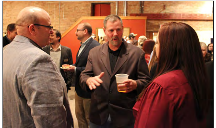
Some 270 members attended the Chamber's Annual Meeting and Dinner on January 16th, enjoying food and drinks from several member businesses before the program and awards.