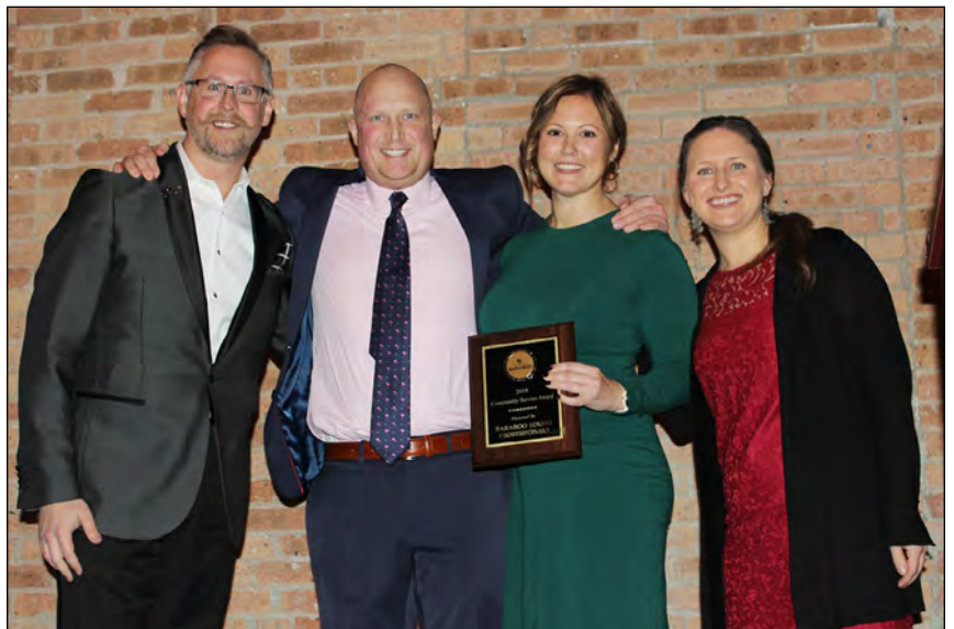
^ COMMUNITY SERVICE AWARD: BARABOO YOUNG PROFESSIONALS