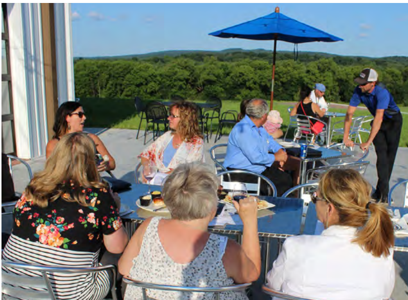
Ambassadors Club meeting Balanced Rock Winery - July 22