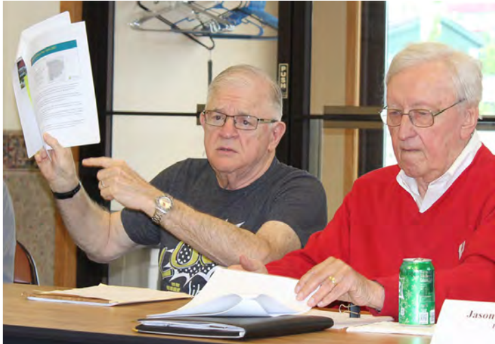
June 17 board presentation Get Loud for the Library