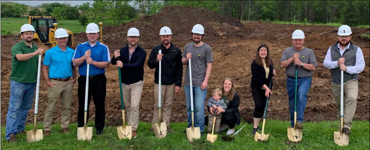
June 4 Ground Breaking DEZ Tactical Arms