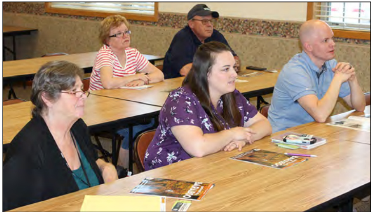
New Member Orientation June 6